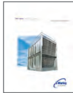
Marley NC Alpha Splash Fill Cooling Tower

SPX Cooling Technologies offers a full line of industry leading products – with exceptional support and innovation designed to help you get the most out of your cooling process. Take a look at these other SPX Cooling Technologies products: