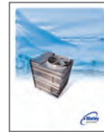
Marley AV Cooling Tower

SPX Cooling Technologies is a world-leading full-line cooling tower and air-cooled condenser manufacturer. The company provides exceptional-quality evaporative cooling towers, fluid coolers and evaporative condensers under the Marley, Recold and Balcke brand names.