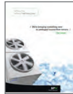
Marley MD Cooling Tower