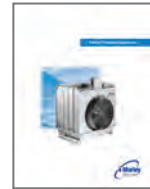
Marley Aquatower® Cooling Tower